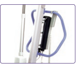
Over-sized push handle for improved handling and manoeuvrability.