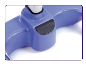
Foot 'push pad' helps reduce the force needed to initiate forward movement.

This view is shared by our clinical consultant team, who have assisted us in conducting detailed usability surveys to ensure the Presence meets the true needs of the patient, carer and the environment in which it operates.