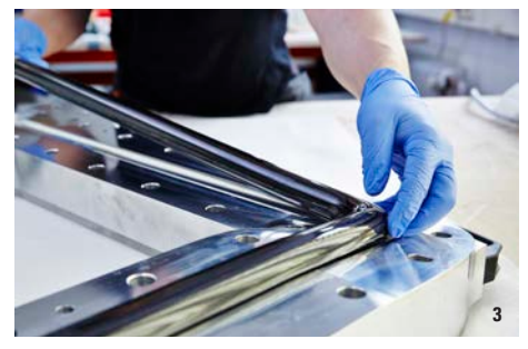
2 In-process quality audit 3 (