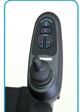
USER FRIENDLY ELECTRONICS