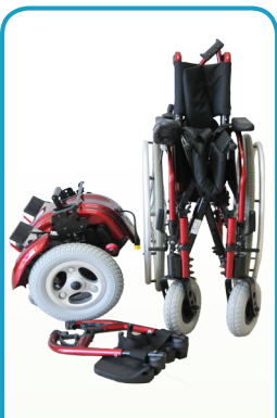
COMPACT & FOLDABLE