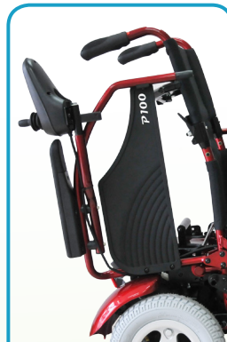
FLIP BACK ARMRESTS