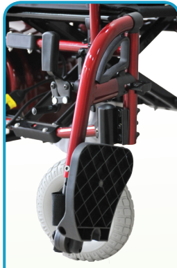
S/A DETACHABLE FOOTREST