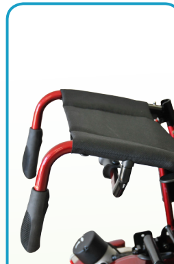
HALF FOLDING BACKREST