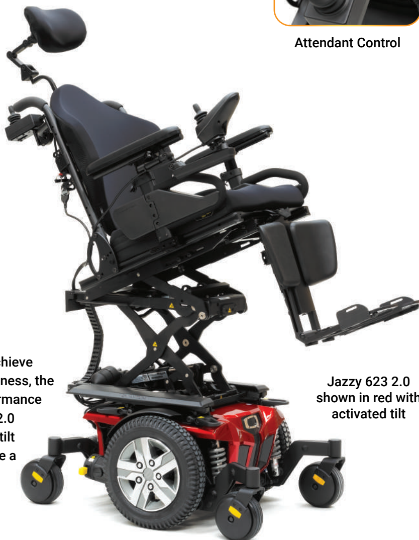
Jazzy 623 2.0 shown in red with activated tilt