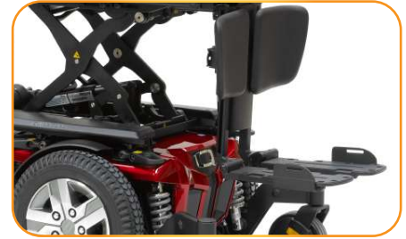
Swingaway legrests with angle adjustable foot plates or centre-mount footboard