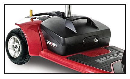
Drop-in Battery Box