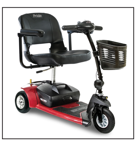
Go-Go® Ultra X 3-Wheel