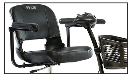
Comfortable Swivel Seat