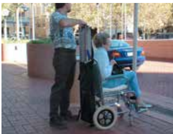
Carry bag for Personal and Multipurpose models.