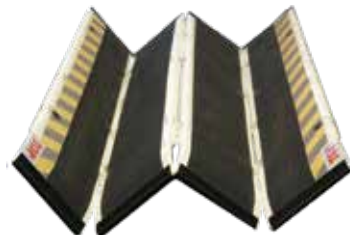
Multi-paneled, hinge system folds with a concertina action, allowing it to be folded to a single compact unit.

Invacare Portable Ramps are available in 4 models, in a wide range of sizes;