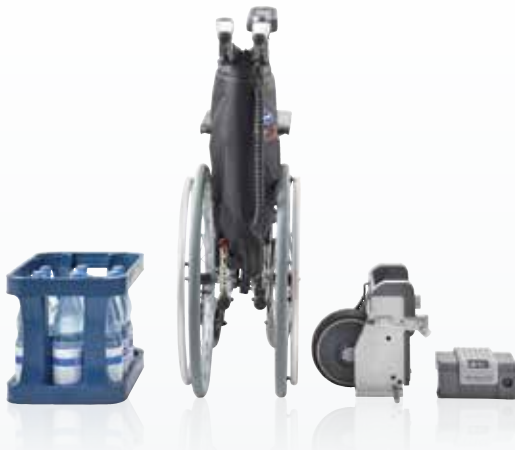
viamobil – small, light, handy and easy to transport

Transporting viamobil is easy and convenient, even in fairly small cars. The individual modules are light and sturdy and have useful carrying handles for quick stowage. No tools or prior manual skills are required to remove viamobil, stow it away in a small space along with the wheelchair and then get it ready for operation again in a few easy steps. This allows you to be mobile simpler and faster.