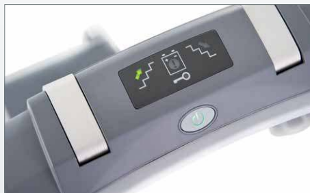
Display showing all functions at a glance