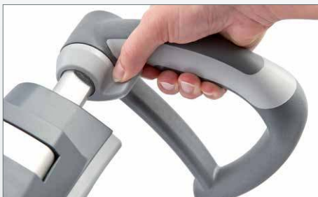
ErgoBalance grips: non-slip with a convenient shape

With excellent ergonomics, all operating elements are in exactly the right place and the stair climber stays in an optimal position in the hands. This is where Alber's more than 25 years of experience in the development of mobile stair climbers can really be felt and experienced.