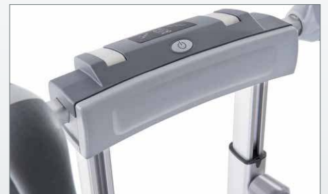
Comfortable cushioning for resting the operating unit on the thigh while climbing the stairs