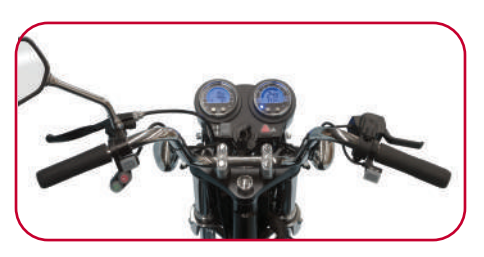
Full digital display

The Sportrider is a unique 3-wheel motorcycle inspired, outdoor, sporty scooter! Features include a full digital display speedometer/odometer, full suspension system, adjustable high-back seat and powerful front/rear lighting kit. Get the scooter with attitude now!