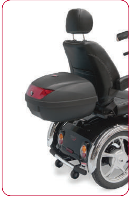
Rear storage pod

<sup>1</sup>Varies with user weight, terrain type, battery amp-hour (AH), battery charge, battery condition and tyre condition. <sup>2</sup>Due to manufacturing tolerances and continual product improvement, this specification can be subject to a variance of (+ or - 3%).