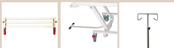
C.EXT1070 200mm Clip On Extension