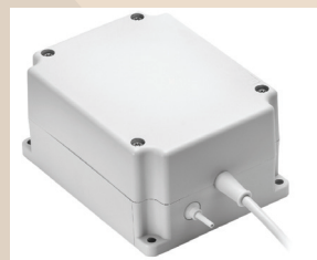
ABB Battery Backup