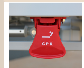
CPR Emergency Release