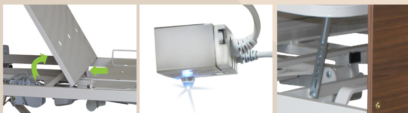
Auto Regression Backrest