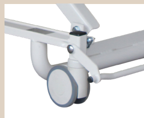
CLOK Central Locking Castors - Twin Wheel 125mm