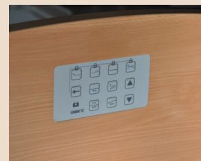
ACK Attendant Control