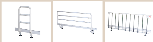
CLP400 Clamp On Support Rail 400mm