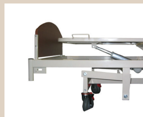
VSE Electric Vascular Support